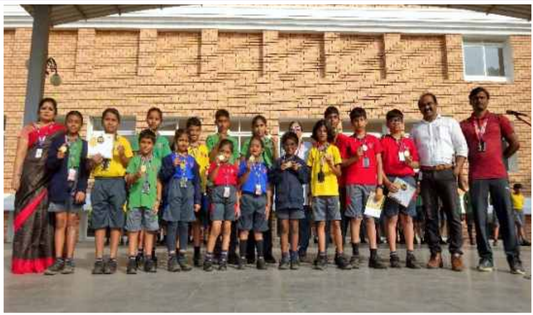
Congratulations!!>> Students secured Gold Medal in SOF Math Olympiad Competitive Exam