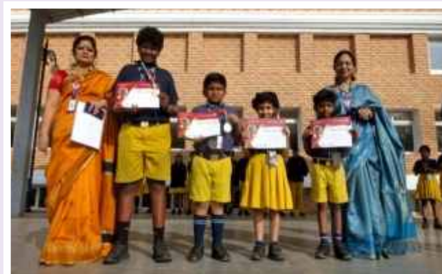
Students secured Gold Medals in Silverzone Olympiad Exam.